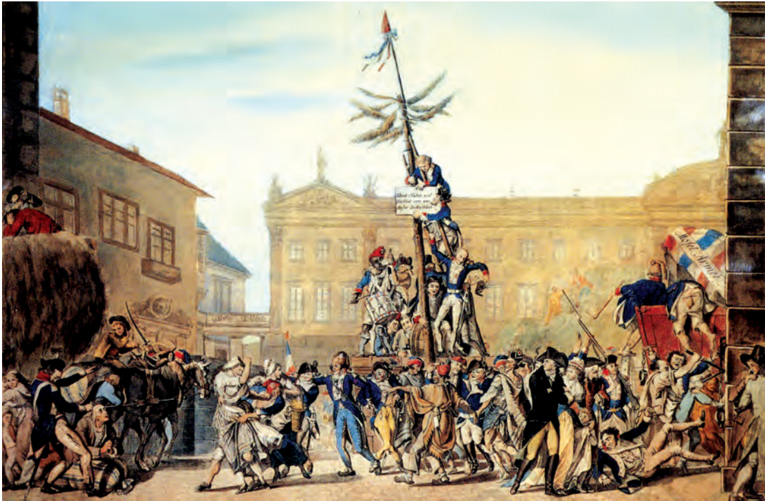
Fig. 4 – The Planting of Tree of Liberty in Zweibrücken, Germany. The subject of this colour print by the German painter Karl Kaspar Fritz is the occupation of the town of Zweibrücken by the French armies. French soldiers, recognisable by their blue, white and red uniforms, have been portrayed as oppressors as they seize a peasant's cart (left), harass some young women (centre foreground) and force a peasant down to his knees. The plaque being affixed to the Tree of Liberty carries a German inscription which in translation reads: 'Take freedom and equality from us, the model of humanity.' This is a sarcastic reference to the claim of the French as being liberators who opposed monarchy in the territories they entered.

enjoyed a new-found freedom. Businessmen and small-scale producers of goods, in particular, began to realise that uniform laws, standardised weights and measures, and a common national currency would facilitate the movement and exchange of goods and capital from one region to another.