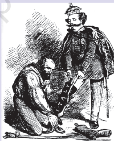
Fig. 15 – Garibaldi helping King Victor Emmanuel II of Sardinia-Piedmont to pull on the boot named ‘Italy’. English caricature of 1859.

In 1867, Garibaldi led an army of volunteers to Rome to fight the last obstacle to the unification of Italy, the Papal States where a French garrison was stationed. The Red Shirts proved to be no match for the combined French and Papal troops. It was only in 1870 when, during the war with Prussia, France withdrew its troops from Rome that the Papal States were finally joined to Italy.