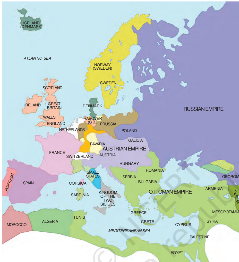
Fig. 3 – Europe after the Congress of Vienna, 1815.

Within the wide swathe of territory that came under his control, Napoleon set about introducing many of the reforms that he had already introduced in France. Through a return to monarchy Napoleon had, no doubt, destroyed democracy in France, but in the administrative field he had incorporated revolutionary principles in order to make the whole system more rational and efficient. The Civil Code of 1804 – usually known as the Napoleonic Code – did away with all privileges based on birth, established equality before the law and secured the right to property. This Code was exported to the regions under French control. In the Dutch Republic, in Switzerland, in Italy and Germany, Napoleon simplified administrative divisions, abolished the feudal system and freed peasants from serfdom and manorial dues. In the towns too, guild restrictions were removed. Transport and communication systems were improved. Peasants, artisans, workers and new businessmen