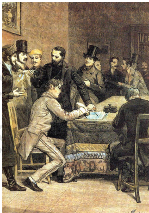
Fig. 7 – Giuseppe Mazzini and the founding of Young Europe in Berne 1833. Print by Giacomo Mantegazza.

One such individual was the Italian revolutionary Giuseppe Mazzini. Born in Genoa in 1805, he became a member of the secret society of the Carbonari. As a young man of 26, he was sent into exile in 1831 for attempting a revolution in Liguria. He subsequently founded two more underground societies, first, Young Italy in Marseille, and then, Young Europe in Berne, whose members were like-minded young men from Poland, France, Italy and the German states. Mazzini believed that God had intended nations to be the natural units of mankind. So Italy could not continue to be a patchwork of small states and kingdoms. It had to be forged into a single unified republic within a wider alliance of nations. This unification alone could be the basis of Italian liberty. Following his model, secret societies were set up in Germany, France, Switzerland and Poland. Mazzini's relentless opposition to monarchy and his vision of democratic republics frightened the conservatives. Metternich described him as 'the most dangerous enemy of our social order'.