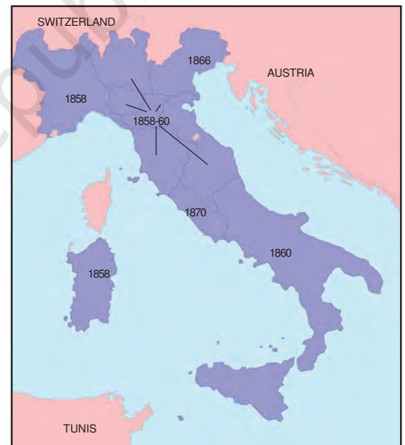
Fig. 14(b) – Italy after unification. The map shows the year in which different regions (seen in Fig 14(a)) became part of a unified Italy.