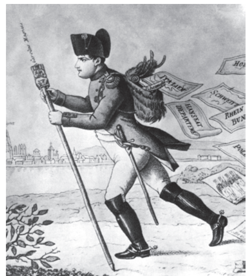
Fig. 5 – The courier of Rhineland loses all that he has on his way home from Leipzig. Napoleon here is represented as a postman on his way back to France after he lost the battle of Leipzig in 1813. Each letter dropping out of his bag bears the names of the territories he lost.

However, in the areas conquered, the reactions of the local populations to French rule were mixed. Initially, in many places such as Holland and Switzerland, as well as in certain cities like Brussels, Mainz, Milan and Warsaw, the French armies were welcomed as harbingers of liberty. But the initial enthusiasm soon turned to hostility, as it became clear that the new administrative arrangements did not go hand in hand with political freedom. Increased taxation, censorship, forced conscription into the French armies required to conquer the rest of Europe, all seemed to outweigh the advantages of the administrative changes.