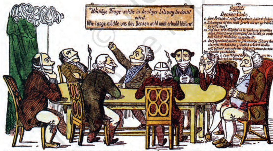
Fig. 6 – The Club of Thinkers, anonymous caricature dating to c. 1820.

What is the caricaturist trying to depict?