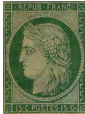
Fig. 16 – Postage stamps of 1850 with the figure of Marianne representing the Republic of France.

Allegory – When an abstract idea (for instance, greed, envy, freedom, liberty) is expressed through a person or a thing. An allegorical story has two meanings, one literal and one symbolic