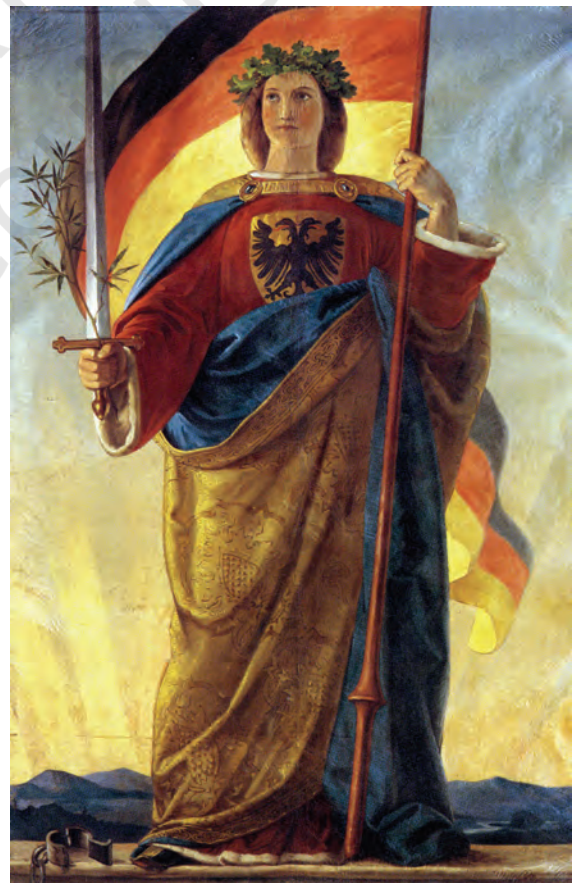
Fig. 17 – Germania, Philip Veit, 1848. The artist prepared this painting of Germania on a cotton banner, as it was meant to hang from the ceiling of the Church of St Paul where the Frankfurt parliament was convened in March 1848.