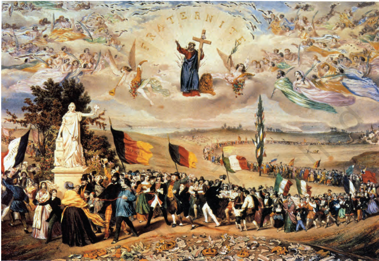
Fig. 1 – The Dream of Worldwide Democratic and Social Republics – The Pact Between Nations, a print prepared by Frédéric Sorrieu, 1848.

In 1848, Frédéric Sorrieu, a French artist, prepared a series of four prints visualising his dream of a world made up of ‘democratic and social Republics’, as he called them. The first print (Fig. 1) of the series, shows the peoples of Europe and America – men and women of all ages and social classes – marching in a long train, and offering homage to the statue of Liberty as they pass by it. As you would recall, artists of the time of the French Revolution personified Liberty as a female figure – here you can recognise the torch of Enlightenment she bears in one hand and the Charter of the Rights of Man in the other. On the earth in the foreground of the image lie the shattered remains of the symbols of absolutist institutions. In Sorrieu’s utopian vision, the peoples of the world are grouped as distinct nations, identified through their flags and national costume. Leading the procession, way past the statue of Liberty, are the United States and Switzerland, which by this time were already nation-states. France,