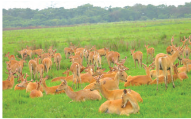
Fig. 2.2: Rhino and deer in Kaziranga National Park

equal importance as a means of preserving biotypes of sizeable magnitude. Corbett National Park in Uttarakhand, Sunderbans National Park in West Bengal, Bandhavgarh National Park in Madhya Pradesh, Sariska Wildlife Sanctuary in Rajasthan, Manas Tiger Reserve in Assam and Periyar Tiger Reserve in Kerala are some of the tiger reserves of India.