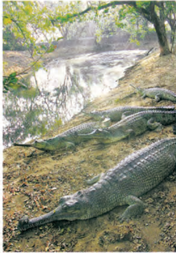
CRITICALLY ENDANGERED: Captive gharial at the Madras C

W ISPY tendrils of mist rise delicately from the water surface, tinged gold by the dawn. Your breath hangs as little clouds of vapour as you gaze upon the Girwa River on a cold winter morning. A trio of hollow clapping sounds from the other side of the river, half a kilometre away tells you that an adult male gharial is advertising his presence. It is the height of the breeding season. The place seems trapped in a time in early history when man was still clad in animal skins. It is only as the sun rises higher and burns the mist off the water that the world comes into focus with appalling clarity. The five-km stretch of the Girwa River in Katerniaghat Wildlife Sanctuary is one of the only three wild breeding sites left in the world for the most unique of all the