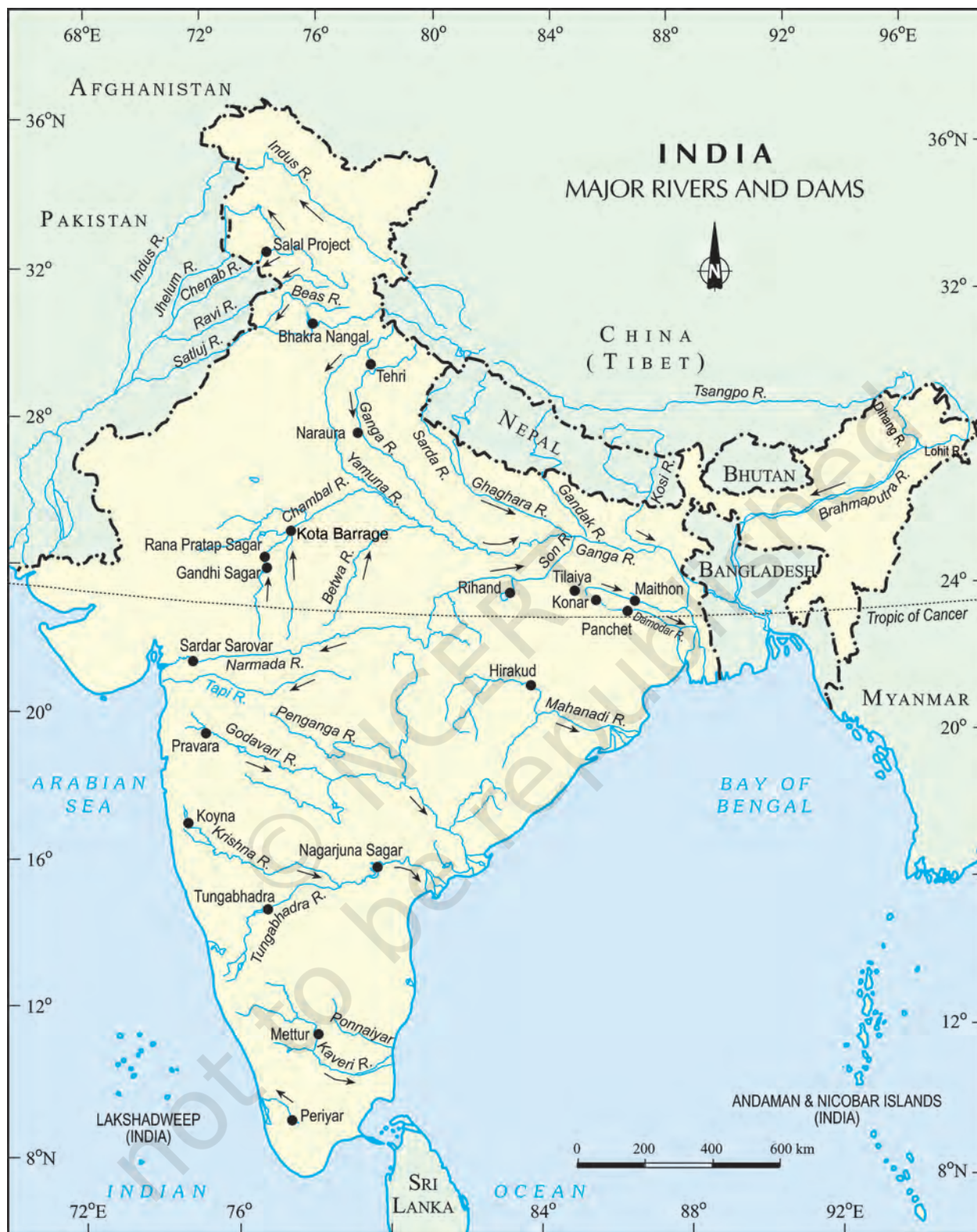
India: Major Rivers and Dams