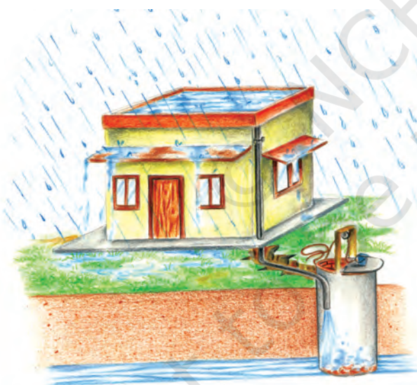
(b) Recharge through Abandoned Dugwell