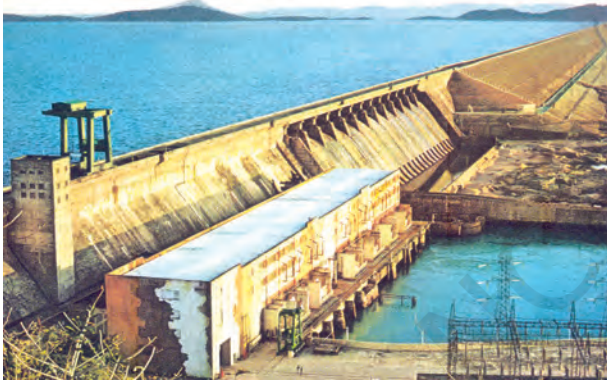
Fig. 3.2: Hirakud Dam

What are dams and how do they help us in conserving and managing water? Dams were traditionally built to impound rivers and rainwater that could be used later to irrigate agricultural fields. Today, dams are built not just for irrigation but for electricity generation, water supply for domestic and industrial uses, flood control, recreation, inland navigation and fish breeding. Hence, dams are now referred to as multi-purpose projects where the many uses of the impounded water are integrated with one another. For example, in the Sutluj-Beas river basin, the Bhakra – Nangal project water is being used both for hydel power production and irrigation. Similarly, the Hirakud project in the Mahanadi basin integrates conservation of water with flood control.