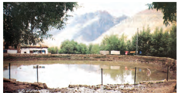
A kul leads to a circular village tank, as the above in the Kaza village, from which water is released as and when required.

The rainwater can be stored in the tankas till the next rainfall making it an extremely reliable source of drinking water when all other sources are dried up, particularly in the summers. Rainwater, or palar pani , as commonly referred to in these parts, is considered the purest form of natural water. Many houses constructed underground rooms adjoining the 'tanka' to beat the summer heat as it would keep the