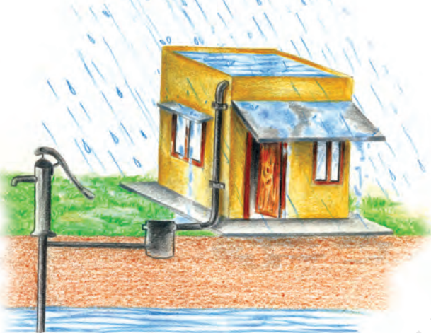
(a) Recharge through Hand Pump

system and were built inside the main house or the courtyard. They were connected to the sloping roofs of the houses through a pipe. Rain falling on the rooftops would travel down the pipe and was stored in these underground 'tankas'. The first spell of rain was usually not collected as this would clean the roofs and the pipes. The rainwater from the subsequent showers was then collected.